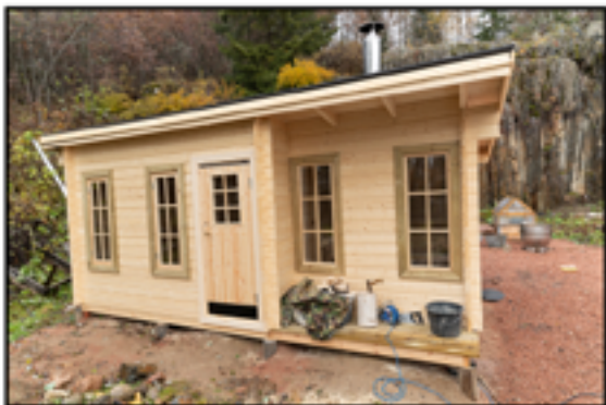
GUESTHOUSE WITH SAUNA

This guesthouse has a small guestroom and sauna.