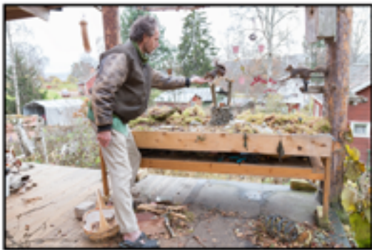
INSIDE THE STUDIO.

In this workshop, we meet red squirrels and birds.