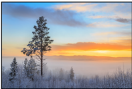
10 MINUTE WALK FROM MY HOME.

Beautiful nature surrounds the house. For those who are interested in forest walks, to make camp, campfires or a fresh swim in cold rivers is this a perfect location.