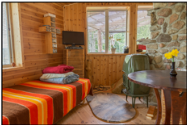
GUESTROOM INSIDE MY HOUSE

When there is a second workshop participant I have a guestroom inside my house.